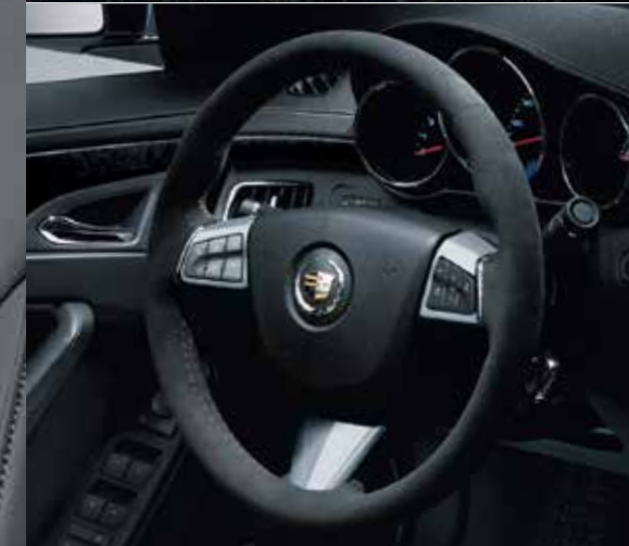
STEERING WHEEL-MOUNTED PADDLE SHIFTERS ON AUTOMATIC TRANSMISSION MODELS

The refined performance of the CTS-V Sedan doesn't end beneath the hood. Inside, we took the same fearless approach to design and execution as we did with the advanced engineering. Available RECARO® seating provides secure back and thigh support to keep you planted during spirited driving. Red LED tracers encircle the tachometer and flash at the approach of engine redline. And the g-meter records and remembers lateral acceleration, storing your best stats for posterity—and to give you something to shoot for. Even the available Midnight Sapele wood trim has a unique purpose. With its distinct dark grain, designers deemed it a perfect match to harmonize with performance-oriented features like the sueded microfiber seat inserts and available microfiber accents on the thick-rimmed steering wheel and shift knob. Adding the perfect finishing detail is the touch-screen navigation, 1 incorporating an ingenious glide-up screen.